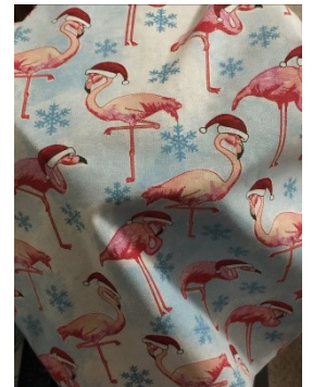
#9a-#9b: Vicki Kidd