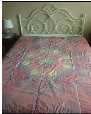
#4a-#4b: Candy Frobish