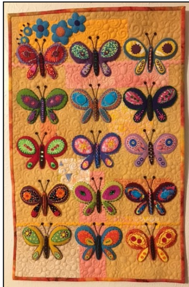
#5: Kyle Mills