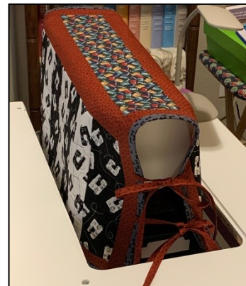
#11a-#11b: Pam Roark