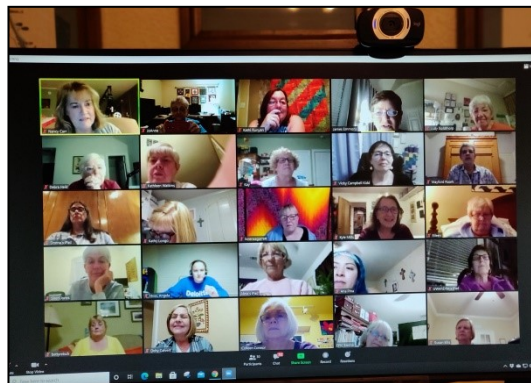
BCQG Zoom Board Meeting