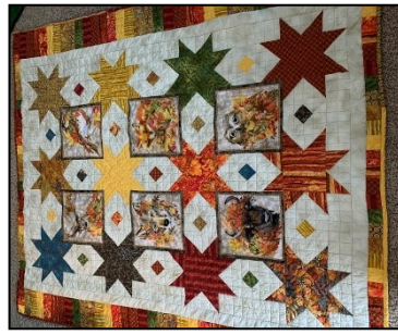
#1c: Angel Hoss